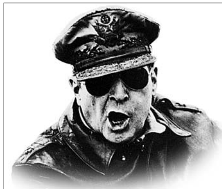
"Mr. Prima Donna, Brass Hat, Five Star MacArthur" Harry S. Truman